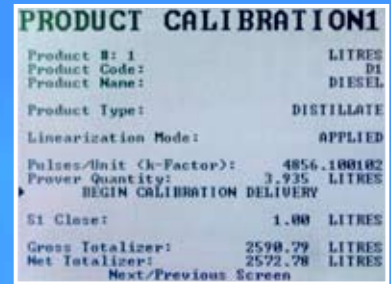
Easy Setup Product Calibration