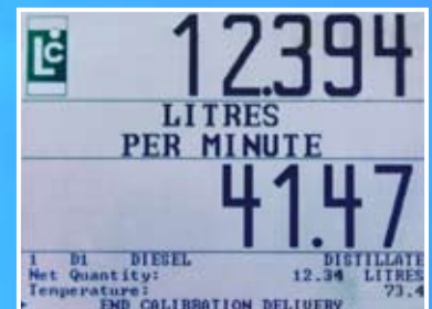
Large Split Screen Display