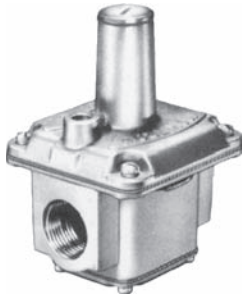
R and RS