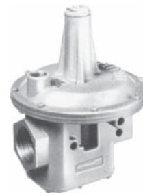
210D, E and G

The 210 Spring Loaded Series has been designed for maximum control functions in an easy to use package, ideal for gas fired boilers, steam generators, industrial furnaces, ovens and similar high demand equipment. You get precise regulation over a broad range of pressures and flow rates with a 210 including zero governor applications. The 210 series is a lock-up type regulator and complies with codes using this specification.